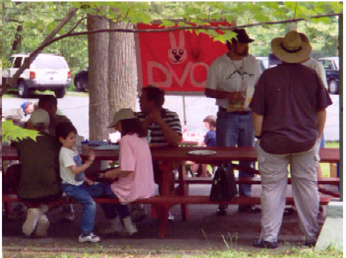
Several DVOAers socialize before the summer meeting at Egelman's Park